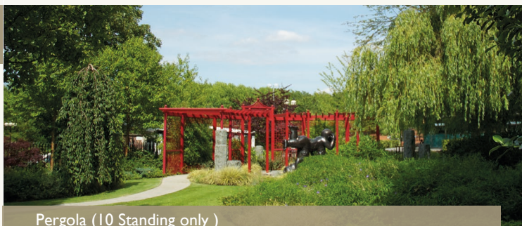
Pergola (10 Standing only )